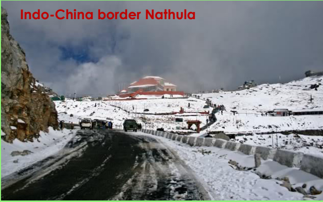
Indo-China border Nathula