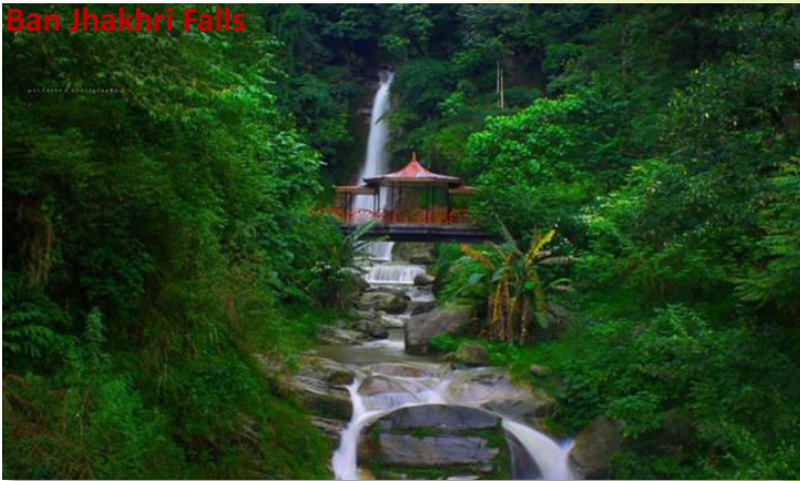
Ban Jhakri Falls