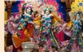
JAIN GLASS TEMPLE