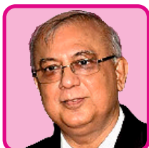
Sukanta Misra Chair