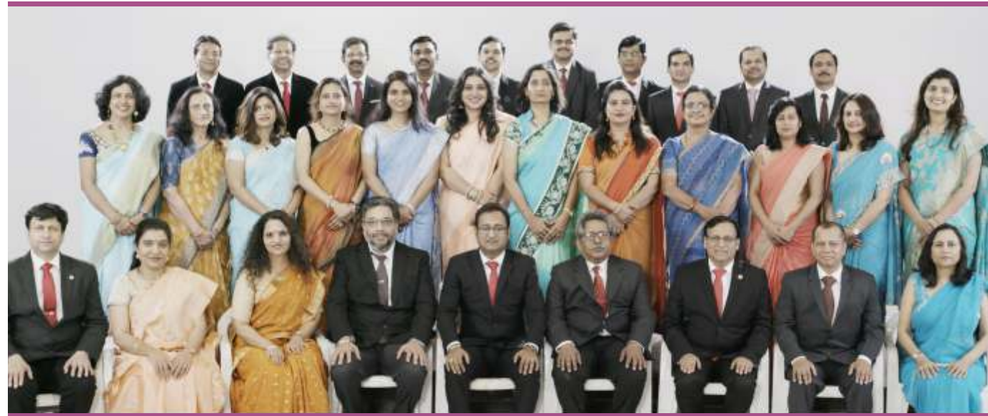
Team POGS 2019-20